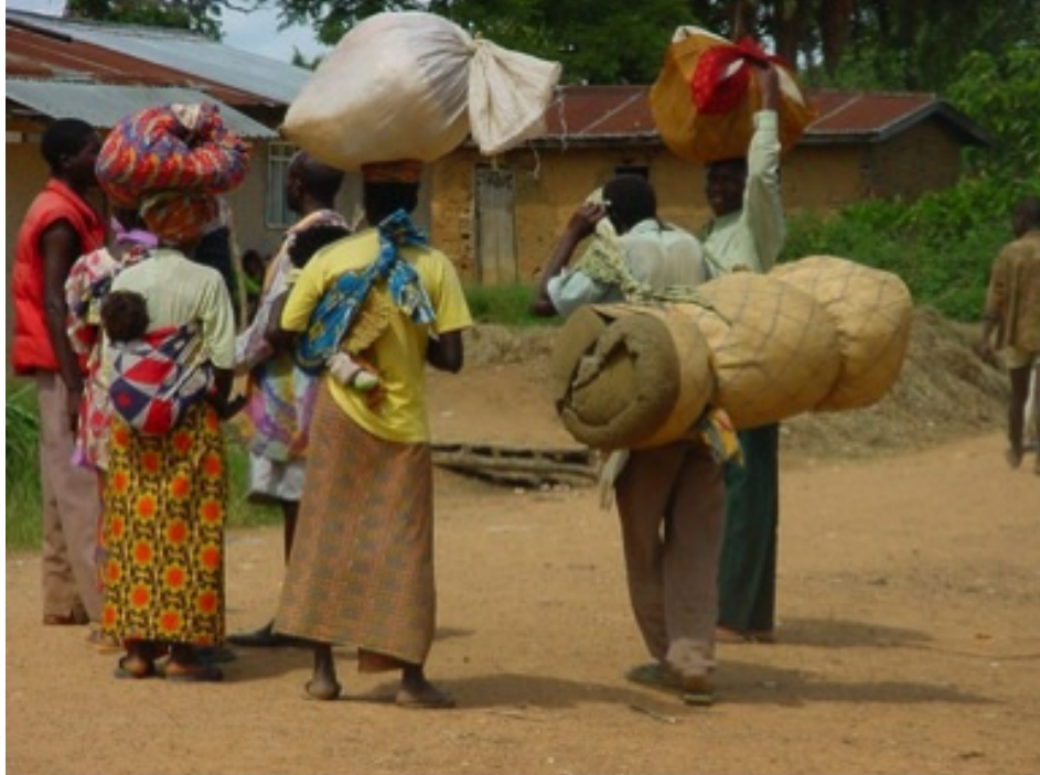
Refugee fleeing war and escaping poverty

Add your name here to the #WithRefugees petition and send a clear message to world leaders that they must act with solidarity and shared responsibility for refugees.