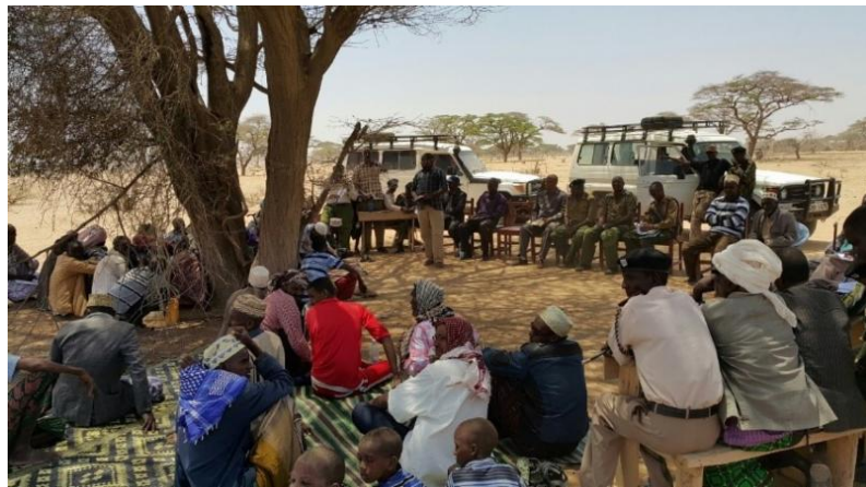
Community Meeting

During the forum, mothers of the disappeared expressed their key concern: difficulty in working with the security forces to locate and return their children.