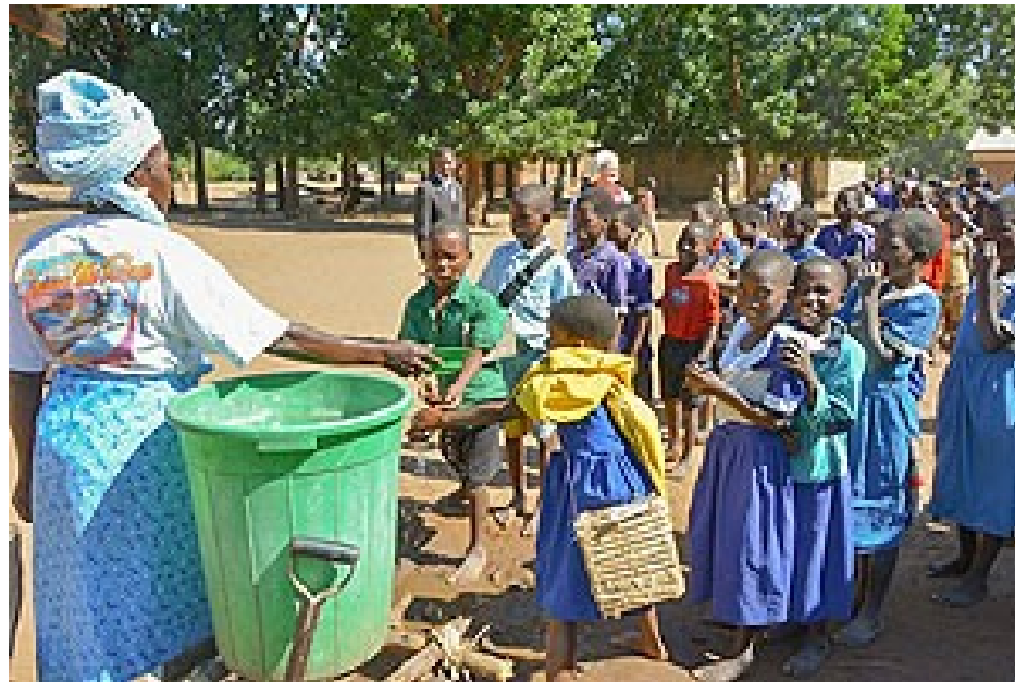
Students at local school in Malawi

Climate change is wreaking havoc on the world's most vulnerable populations.