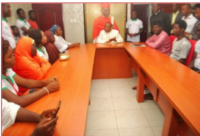
Youth Leaders meeting with H.E. Onaiyekan in Abuja

A highlight of the three-day training was a solidarity visit to an Internally Displaced Persons' camp. There, youth leaders assisted in distributing medicines and aid to help ease burdens.