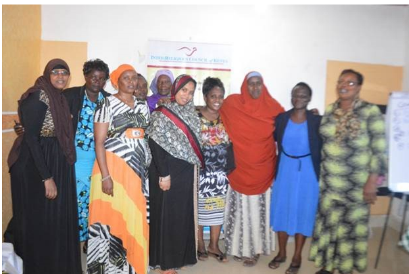
Members of the Isiolo Women of Faith Network-RfP

Hundreds of youth in Isiolo County, north Kenya are missing.