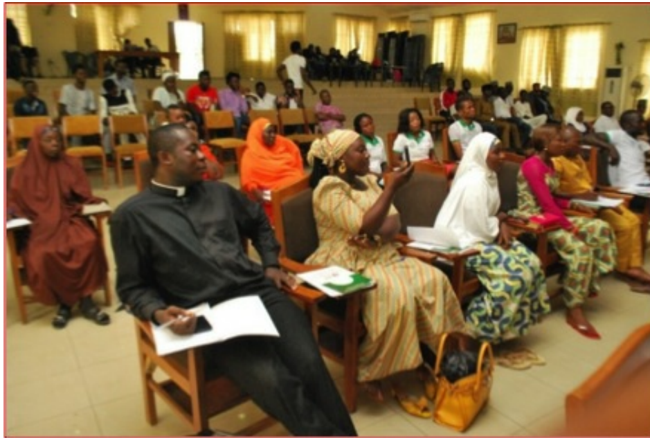
Youth Leaders at the Training in Abuja