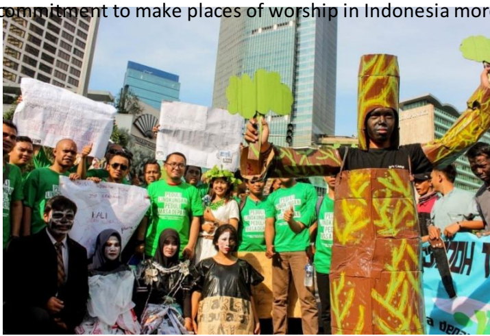
RfP GIYN Leaders - United Kingdom

commitment to make places of worship in Indonesia more environmentally friendly.