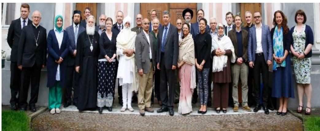
Members of the ECRL-RfP

The European Council of Religious Leaders-RfP -comprised of eminent Buddhist, Christian, Hindu, Jewish, Muslim, Sikh and Zoroastrian leaders-are putting their beliefs into action to address challenges facing Europe, including mass migration, escalating unemployment, violent religious extremism and socio-economic and political exclusion.