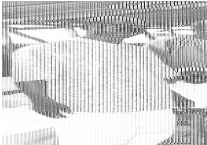
Students at local school in Mozambique

President of RfP] , Rissho Kosei-kai has allocated millions of Japanese yen to humanitarian partners in Malawi and Mozambique.