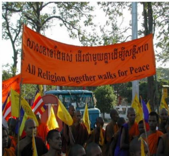
Left to Right: Women of Faith in Liberia at Peace Rally & Monks marching for Peace in Cambodia

On 21 September, people in villages, towns and cities around the world will engage in peace-related activities in observance of the International Day of Peace (Peace Day).