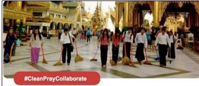
Youth Leaders cleaning the famous Buddhist temple, Shwedagon Pagoda, in Yangon, Myanmar

Across five continents, thousands of young religious leaders in the RfP Global Interfaith Youth Network (GIYN) celebrated 2016 World Environment Day by cleaning, praying and collaborating.